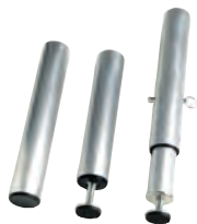
Fixed Height, Adjustable Feet and Telescoping Legs