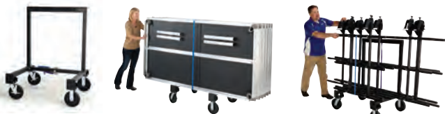
Universal Move and Store Cart – For Decks and Guardrails

Guardrails are 42" (107cm) high with a black powder paint finish and comply with IBC requirements for loading, featuring two uprights and two cross bars. An optional infill panel can be added that complies with the IBC 4" (10cm) sphere code. Guardrails clamp to the stage without the need for tools and function as a chair stop.